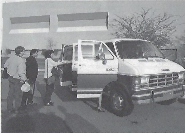
Pride photos by Guy Mancuso

The monthly fare also varies, depending on the price of gas, but it usually costs about $60 for full-time riders. Honeywell also pitches