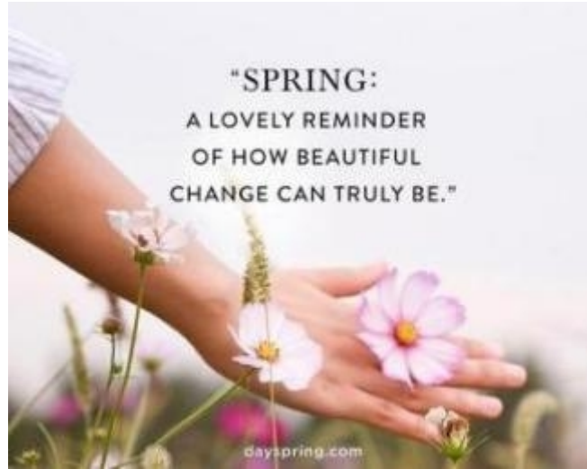
April is the beginning of life being positive