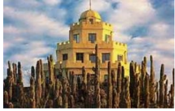
Event is on with COVID Precautions

"We will be taking every precaution to ensure the health and safety of our Guests and Staff. Everyone is required to wear a mask, will practice social distancing, with tour sizes broken into smaller groupings." Most of the tour is outside riding on Golf Carts. This maybe relaxed by the tour date.