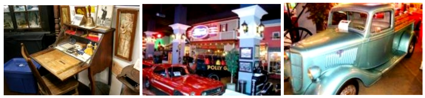
<u>Please tell me if you are staying for a meal as space is limited to 30 people</u>. Diner Menu. <u>http://sandersonford.com/Starliner-Diner</u>

This free tour is at 9:30 am in Glendale. The tour lasts 60 – 75 minutes. Afterwards you may visit the Starliner Diner on the same site and purchase a late breakfast or lunch. For reservations contact Keith Hughes at keith8411@cox.net.