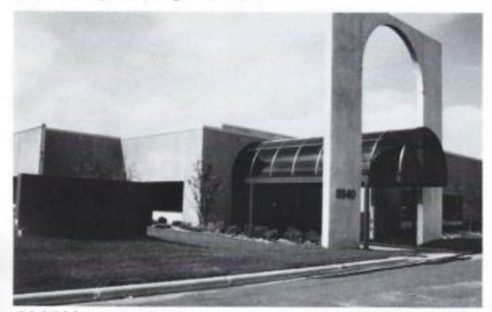
236,000 square feet