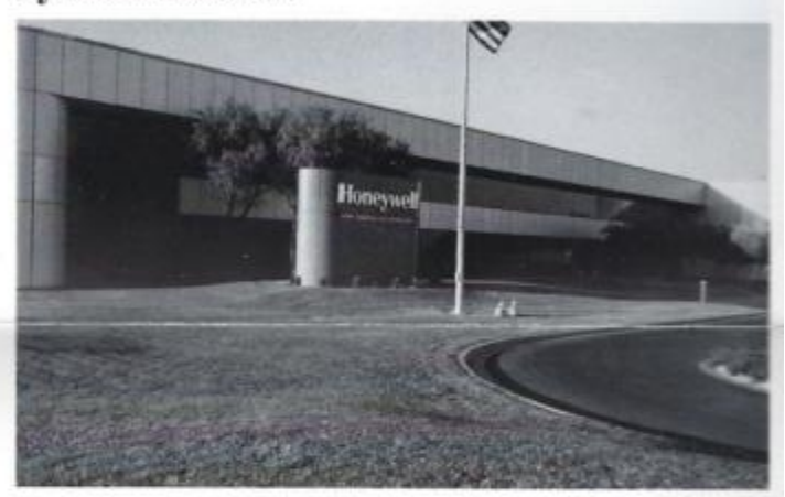
368,114 square feet