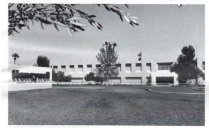
1,233,885 square feet

(Facility includes Group and Central Technical Operations)