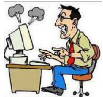
I hit the Control key... so why am I not in control?