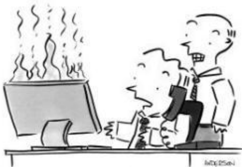
"I think we're past the point where rebooting will help."