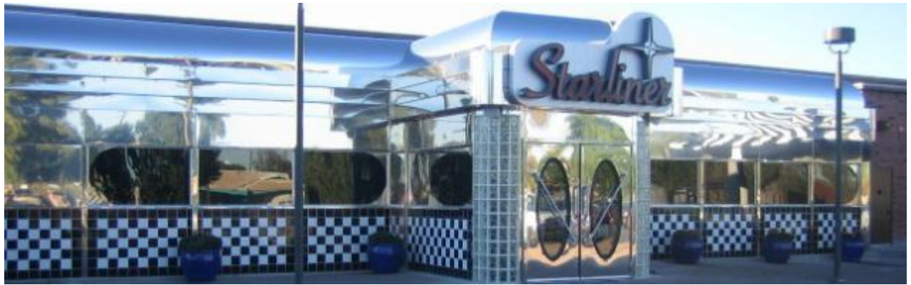
Diner Menu. http://sandersonford.com/Starliner-Diner