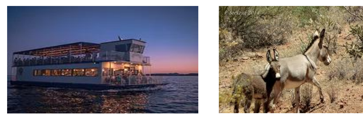
If we are lucky, we will see some of the local area wildlife during the cruise.

The tour will begin at 12:30 PM. Boarding the Phoenix begins at 30 minutes before the departure. Plan to arrive at Lake Pleasant Marina 45 minutes before cruise departure to allow for walking time to the marina from the parking lot.