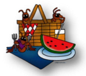
Come join the fun & association

We will be collecting canned goods for the Desert Mission Food Bank. If you would like to donate to this worthy cause, please bring two cans of food.