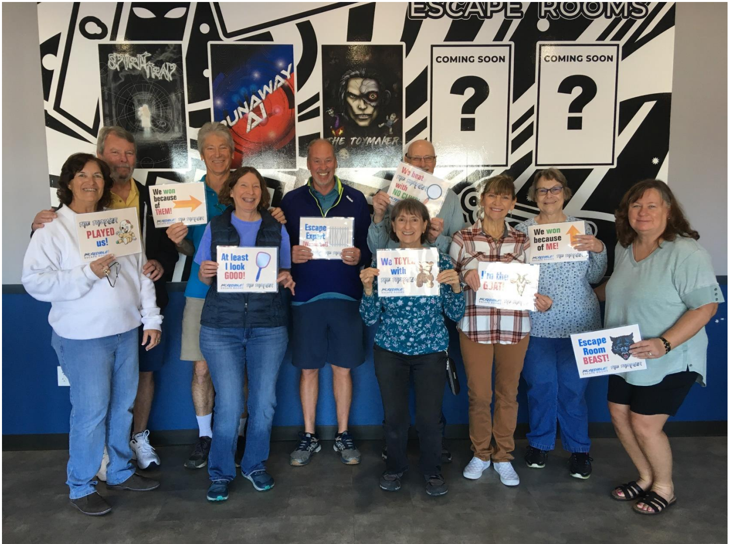
Incredible Escape Room adventure was a great success. We maxed out the room with 10 people and managed to escape with only 4:27 left on the clock. Lunch afterwards was delicious at Freddy's.