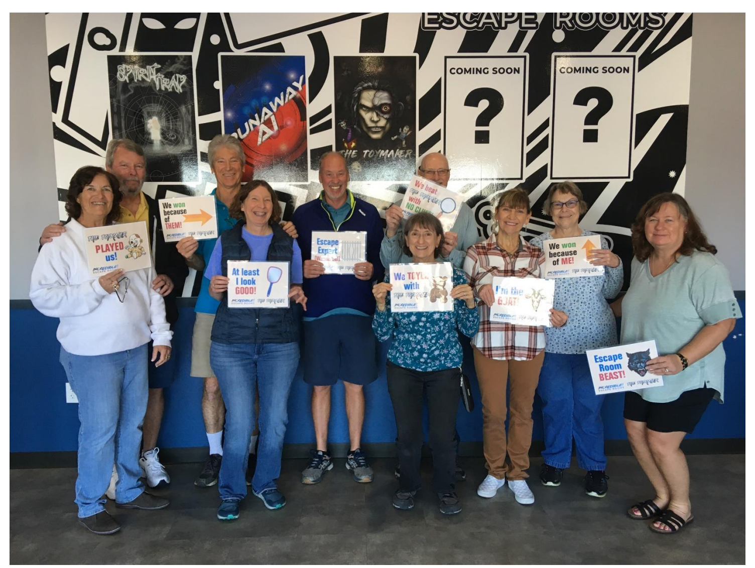
Incredible Escape Room adventure was a great success. We maxed out the room with 10 people and managed to escape with only 4:27 left on the clock. Lunch afterwards was delicious at Freddy's.