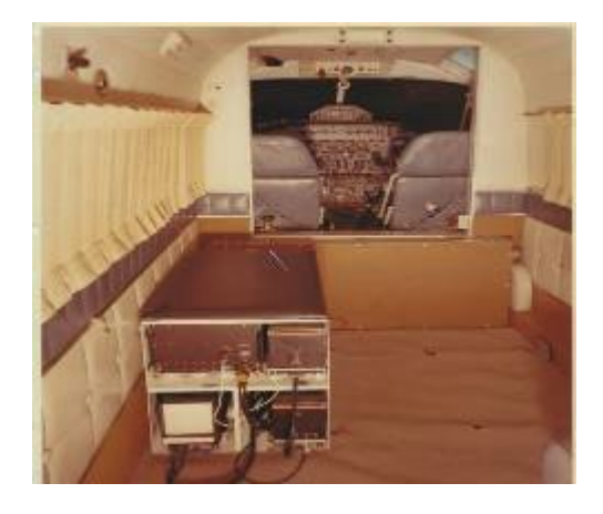
Figure 2 - Mark I Pallet in Twin Beech