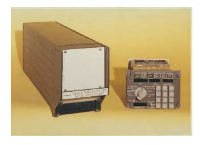
Figure 1 "Mark I RNAV"

The studies and flight testing of the Mark I led to the recognition that far more automation and better human factors were needed to have a viable system for commercial aviation. This led to the development of the Tern 100 Area Navigation System.