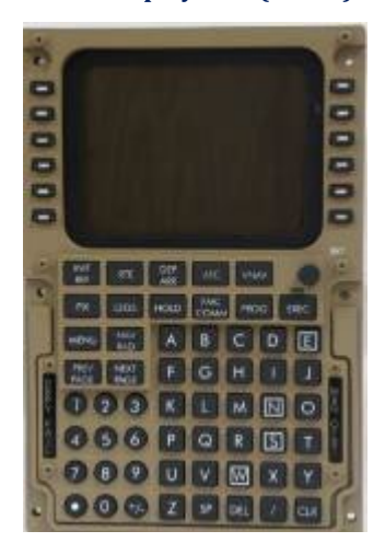
Figure 4 - Boeing MCDU

Subsequently Boeing has selected the Honeywell FMS for the 747-400, 747-8, 777 and 787. The hardware has changed, and many more functions have been added but the operational interface (CDU/MCDU) with the crew has remained pretty much the same as the 767 FMS. Figure 4 shows a Boeing Multi-Function Control and Display Unit (MCDU).