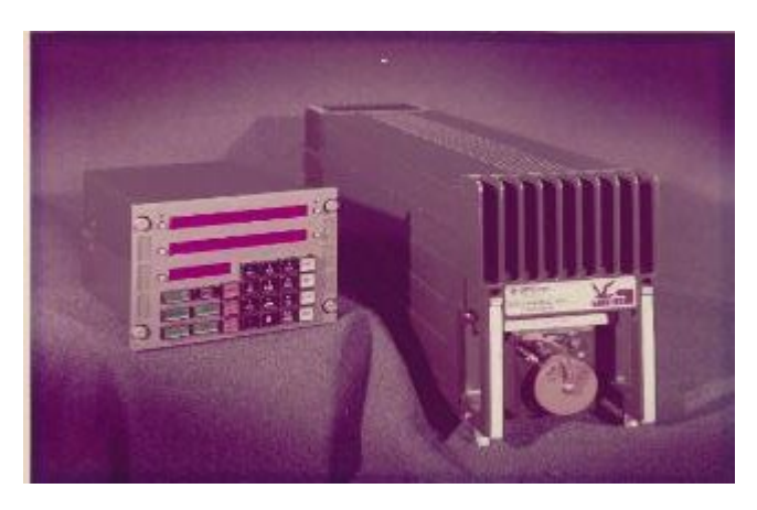
Figure 3 - Tern 100 Area Navigation System

One of the services that started with the Tern 100 was the Nav Data Base Service. The FMS Nav Data Base Service has grown to be a significant revenue contributor for Honeywell every year. Figure 3 shows the Tern 100 System.