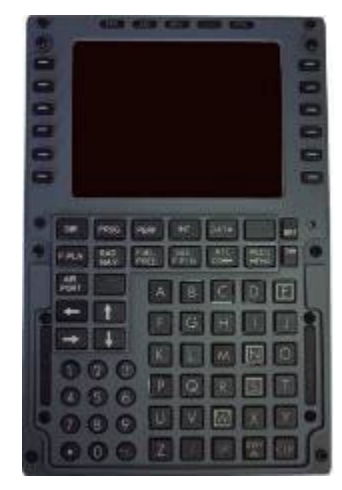
Figure 5 - A320 MCDU

Subsequently Airbus selected the Honeywell FMS for the A300-600, A320, A330, A340 and A380. The hardware has changed, and many more functions have been added but the operational interface (CDU/MCDU real/virtual) with the crew has remained pretty much the same as the A310. Figure 5 shows an A320 MDCU.