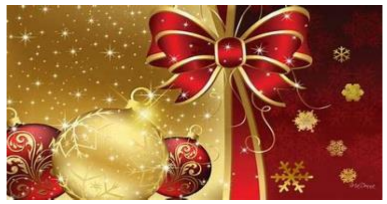
Aero Activities Club & Honeywell Retire Social Club