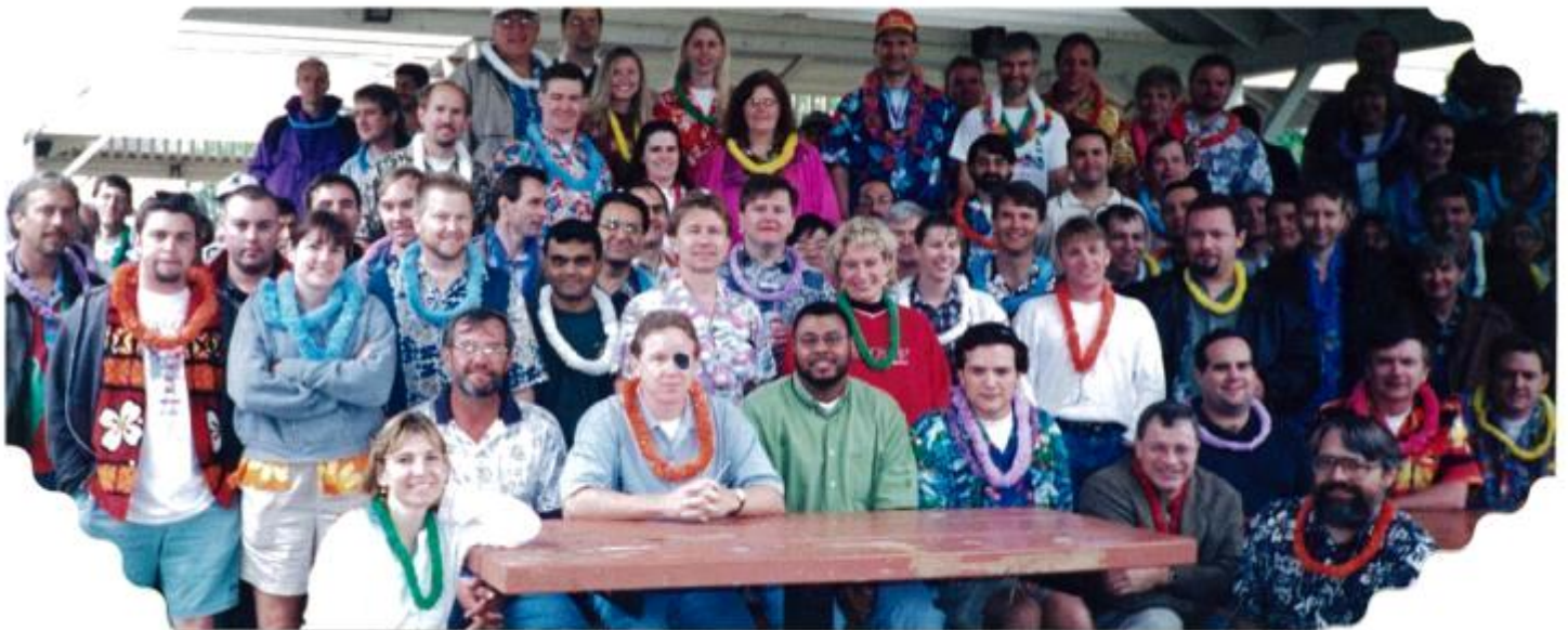
Commercial Aerospace Flight Controls Team, Spring Picnic, ~ 2002