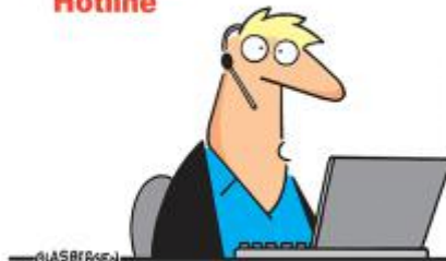
"I checked the serial number of your laptop. It's a waffle iron."