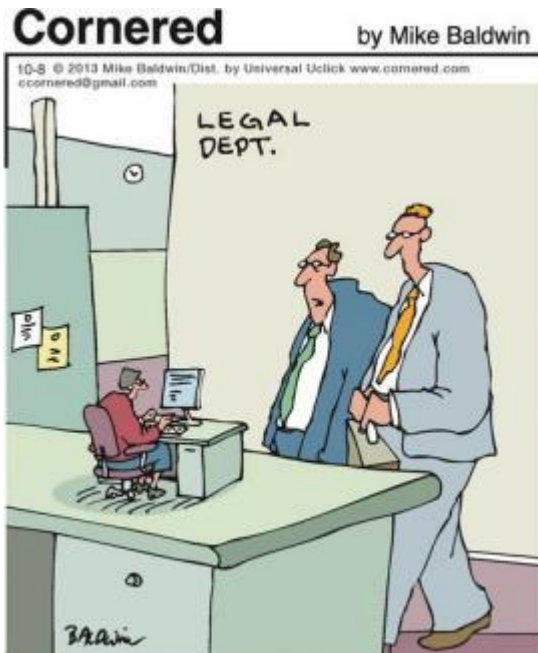
"That's where we add the fine print."