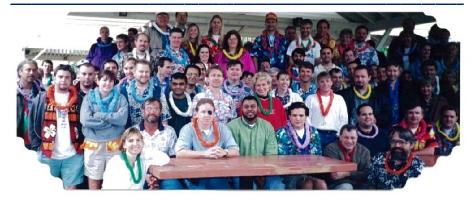
Commercial Aerospace Flight Controls Team, Spring Picnic, ~ 2002