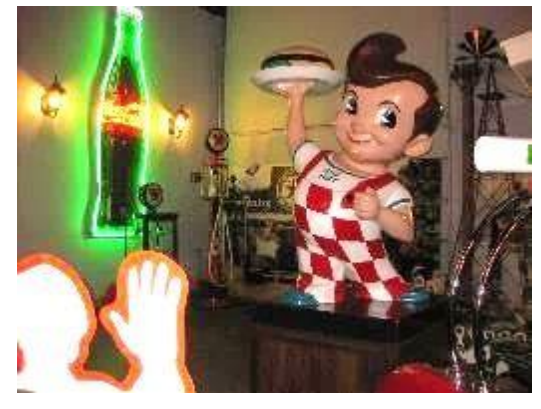
Eighteen people attended the 20,000 square-foot warehouse which has so much to see; there are dozens of cars and nostalgic items, a beautifully recreated old mercantile store, Coca Cola items from the '30s through the '50s. and so much more.

Starliner Dinner is a great way to caught up on what you saw and enjoyed at the museum