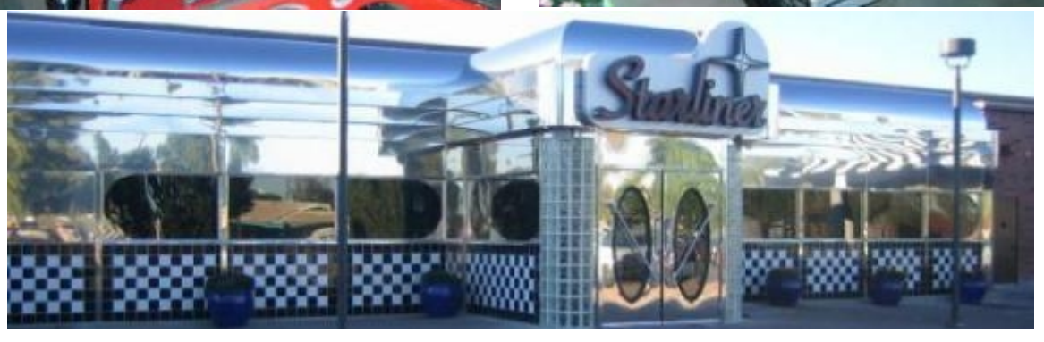
Diner Menu. http://sandersonford.com/Starliner-Diner