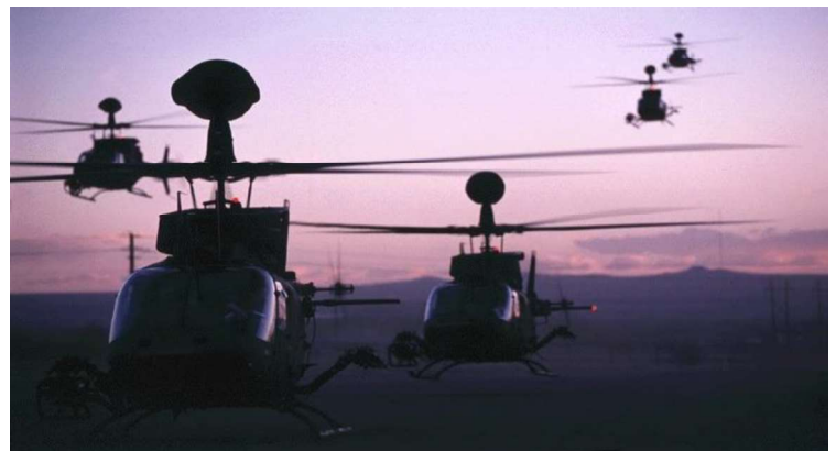
Kiowa Warrior Crews Fly in to Albuquerque Facility to Thank OH-58D Team