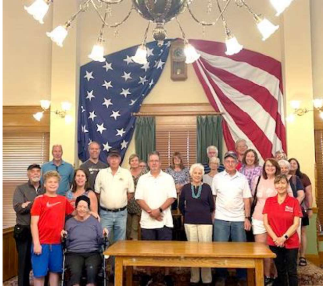
We visited the historic house chamber, which has been restored to look as it did during the 1910 Arizona Constitutional Convention.