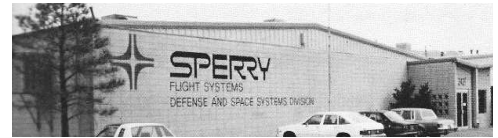
Aztec – Sperry's First Albuquerque Home