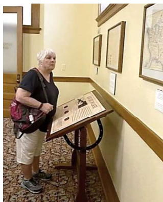
The museum tour was followed by a visit to Senate Building. They were not in session, but we learned how we can view our lawmakers at work.