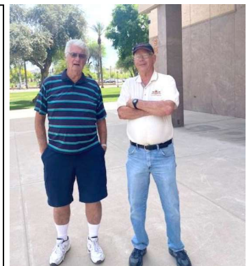
We had time to visit with old friends after the tour.