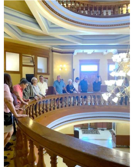
We saw exhibits and enjoyed the unique architecture on four floors