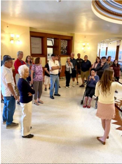
We had 21 attendees at this fun and enriching event.