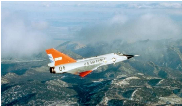
Honeywell Designed QF-106 Full-Scale Aero Target Drone