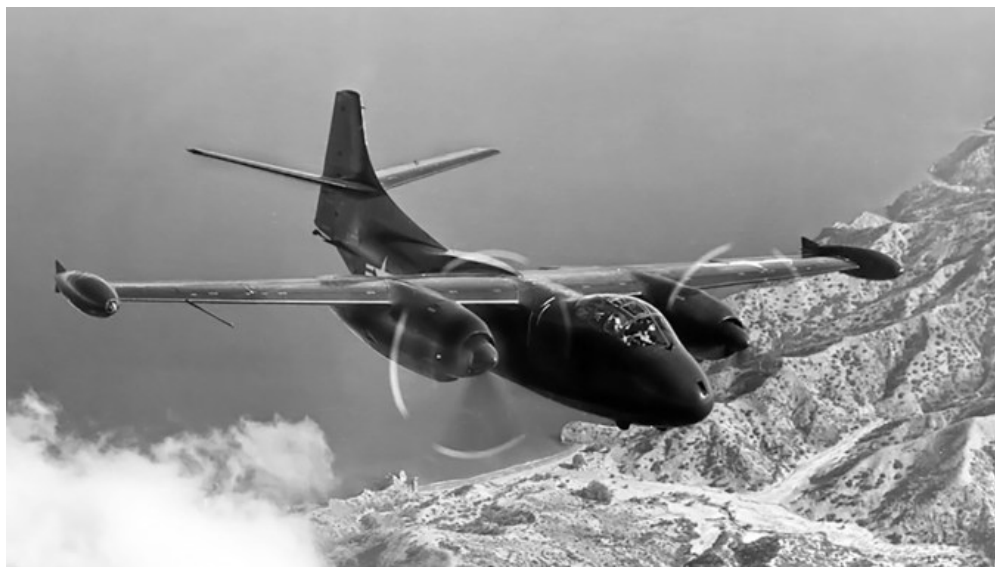
AJ Savage in flight.