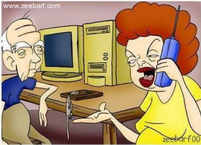
"Okay your father managed to get a mouse. Now how do we use it?"