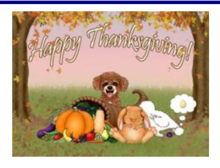
Watch for all our upcoming Activities Sponsored by the Sperry & Honeywell Clubs