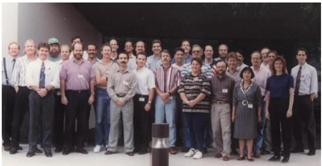
No Dates available