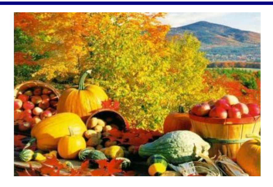
Watch for all our upcoming Activities 2017 Sponsored by the Sperry & Honeywell Clubs