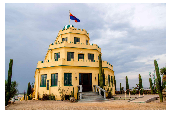
Friday Nov 4th