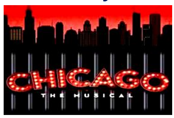
Thursday October 7th

Location: 7701 W. Paradise Lane, Peoria.