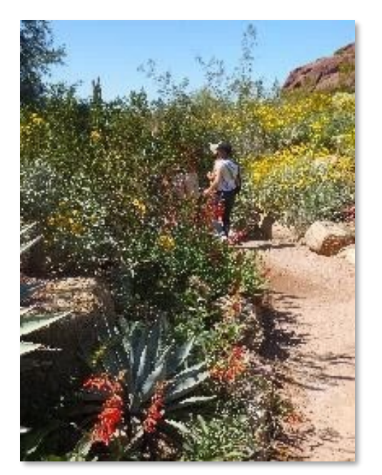
Free admission days, Second Tues of each month - 8AM - 6PM

The Desert Botanical Garden has free admission on the second Tuesday of the month from the hours of 8-6 PM. The garden and the neighboring Phoenix Zoo are accessible from the bus line; however, not by the light rail.