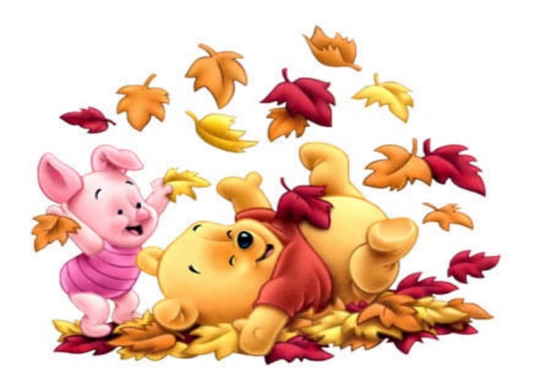
Fall is beautiful; the leaves fall, kids play in them and we get to pick it all up.