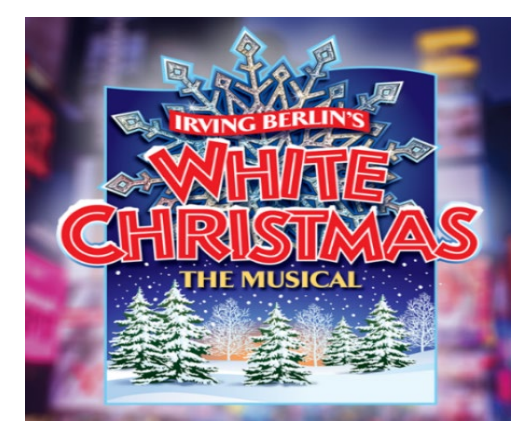
7701 W. Paradise Lane, Peoria, AZ 85382 COST: $70 per ticket. See details below.

Based on the 1954 Paramount film with music and lyrics by Irving Berlin: Bob and Phil, a military veteran song-and-dance duo, fall head-over-heels for a stunning sister act en-route to a Christmas stage show. Their romantic pursuits land them in a magical Vermont inn owned by their former commander, General Waverly. As the inn falls on hard times, it's up to Bob and Phil to bring business in, but will their yearning hearts pull them in another direction? Featuring spirited songs from Irving Berlin, White Christmas sparkles with holiday cheer, dancing, and laughter.