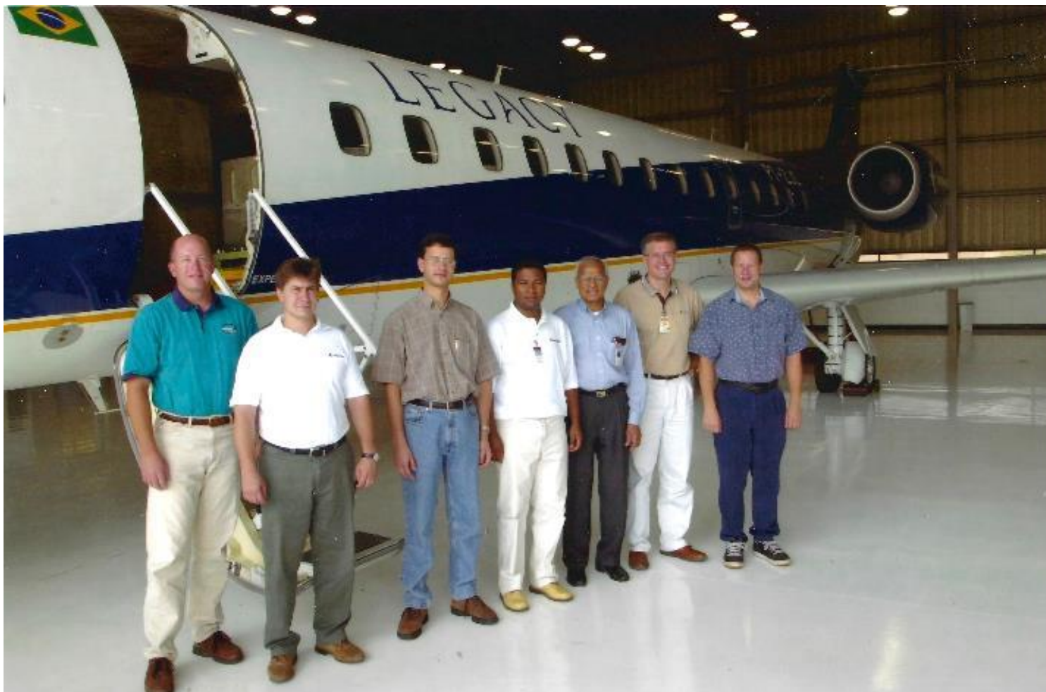
Deer Valley 11-25-2015