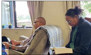
⇨ Apostolic Church, Gisborne New Zealand