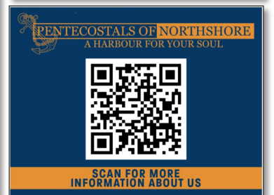
Ministering at Pentecostals of Northshore Church