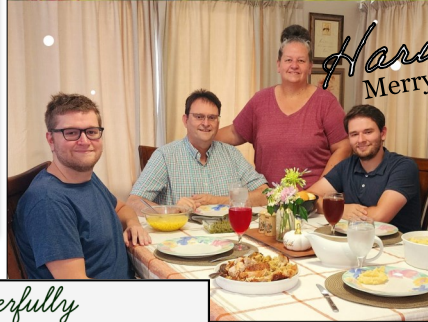
Hari Kirikimate Merry Christmas in Māori