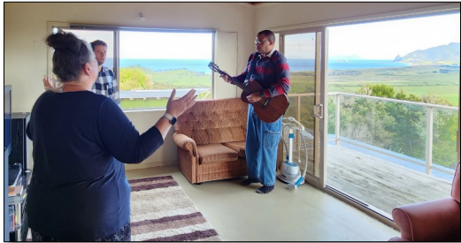
Church service near Whangārei Heads