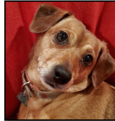
We rehomed Daisy

times things that only clutter, or burden you aren't revealed until you've truly come to terms with where you are, and where you're headed. Let's also not forget the people we're leaving behind. Those who will be missed, and those who will miss us. Friends and family who made life a little better everyday. Many of these