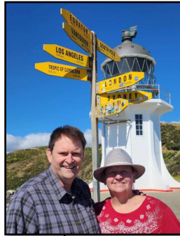
Covering the nation with prayer from North to South

We have completed our month-long prayer journey, traveling from the very top of New Zealand all the way to the bottom. Throughout the journey we constantly witnessed the creative work of our amazing Creator, through the natural beauty of this island jewel called "Aotearoa" (land of the long white cloud) which is remotely nestled between the Tasman Sea and the vast Pacific Ocean. It has been awe-inspiring to say the least! Its majestic snow-capped mountains, rolling hills, towering kauri trees, craggy rock formations, deeply-carved gorges, startling blue waters, seemingly endless skies, colorful autumn leaves still clinging to the trees, rain showers that bring vibrant rainbows, and the crashing waves of its seas have drawn us closer to Him and to the souls of this land He has called us to. We are enthralled by its wondrous beauty that He has made for man's enjoyment, but have especially been drawn to the warm and friendly people of our new homeland.