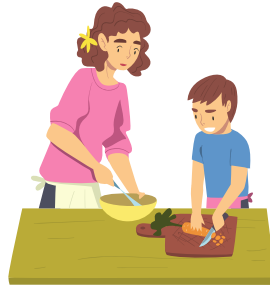
Make & pack lunch