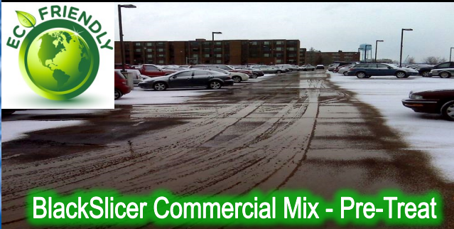
BlackSlicer Commercial Mix - Pre-Treat