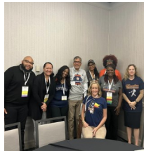
HGC had a strong showing at nationals in Tampa.