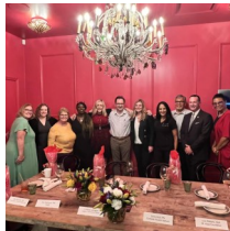
"State of HIV in Houston" a huge success with a panel discussion.