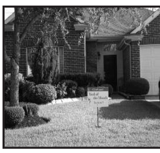
Section V 14214 Silver Glade