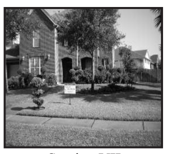
Section VII 14010 Blue Vista