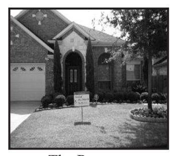
The Reserve 2002 Lincoln Crest