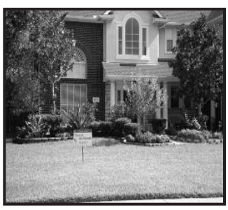
Section I 14234 Deep Cove

Please join us in congratulating our July 2011 Yard of the Month Winners!