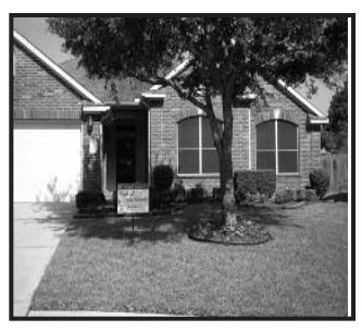
Section IV 2327 Meadow Briar