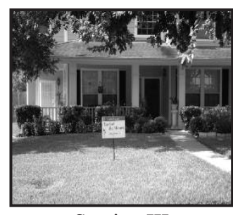
Section III 14003 Sandy Spring