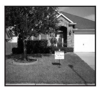
Section VI 2315 Ashley Ridge Ct