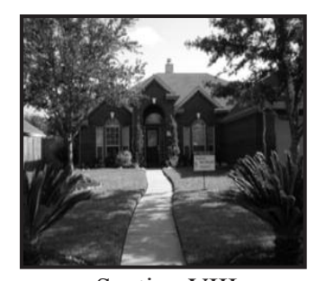
Section VIII 14206 Cobalt Glen