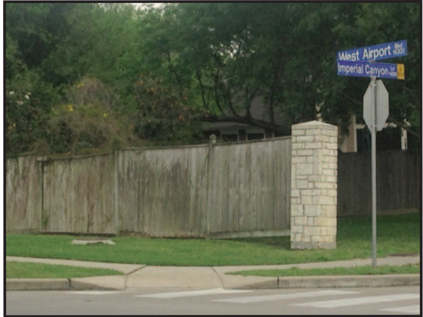
This is what we started with...

When we started at the beginning of the year, we were faced with the challenge of how to address the run down appearance of the community and fix the code enforcement issues to avoid fines from the City of Sugar Land. Unfortunately we also had to do these repairs with inadequate funds.