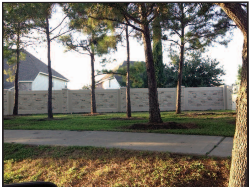
Now we have a new cement fence on W. Airport!