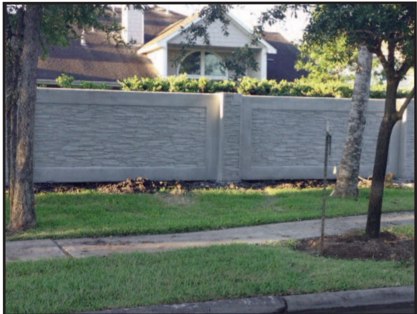
Need caption for this picture.