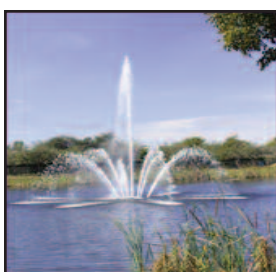
Picture of the new fountain we are trying to purchase for the Imperial Canyon Lake

As the year comes to a close we would like to recap some of the progress we have made in Glen Laurel to improve the appearance of the community. While we still have more work to do to address some areas still in need of repair, we want to share with you some of the photos we have taken over the last year. We hope you enjoy these pictures of some of the progress made. Please see the photos and commentary on pages 2,4 & 6.