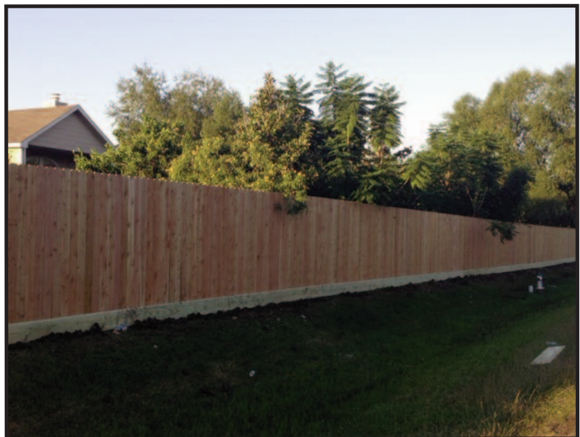
New fence on Florence 8ft.