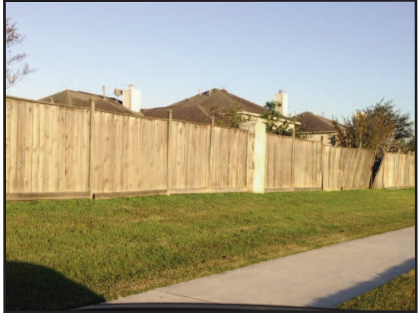
This is the Burney fence which is still in need of repair!