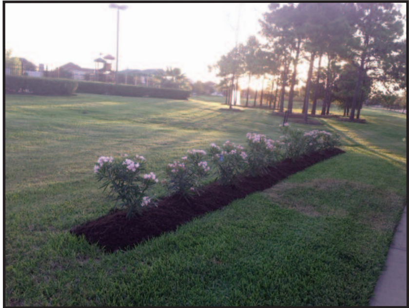
New landscaping areas at the pool!