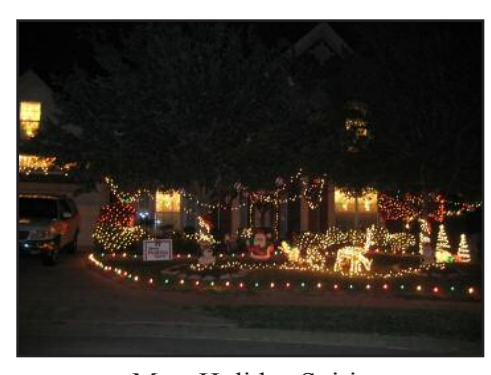
Most Holiday Spirit 14014 Sea Myrtle