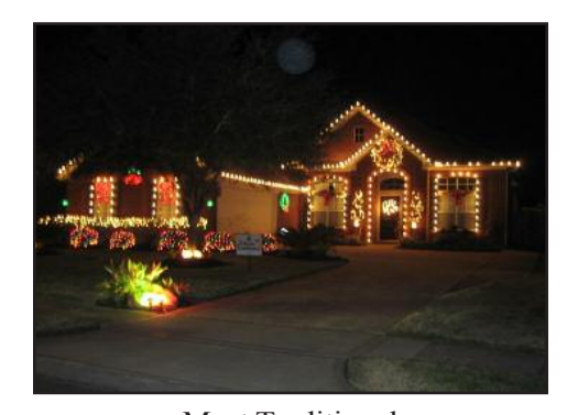
Most Traditional 2015 Avana Glen