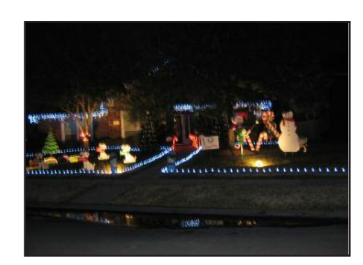
Most Creative 13819 Blue Vista