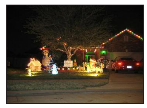
Best Childrens Theme 14206 Valley Bend