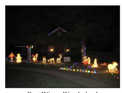
Best Winter Wonderland 14122 Beckett Wood