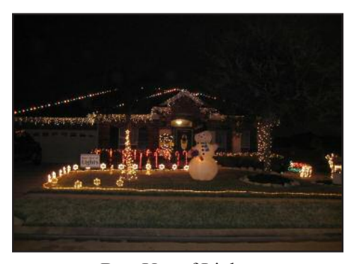
Best Use of Lights 13702 Charterhouse Way