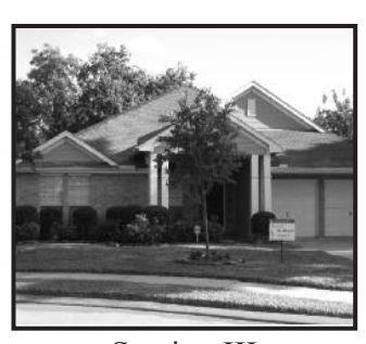
Section III 14005 Imperial Canyon