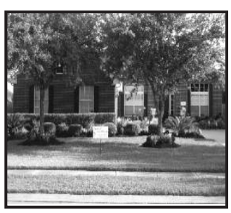
Section I 2015 Avana Glen

Please join us in congratulating our June 2011 Yard of the Month Winners!