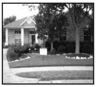
Section II 14122 Laurelstone