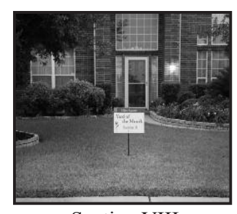
Section VIII 13806 Blue Vista