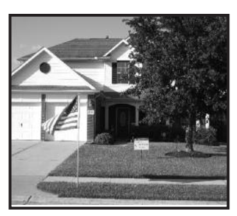
Section VI 2322 Cool Springs