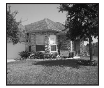
The Reserve 13719 Saxony