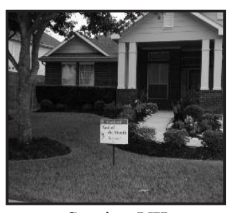
Section VII 13818 Blue Vista