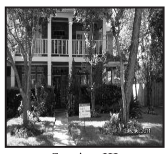
Section III 14003 Imperial Canyon