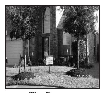
The Reserve 13738 Hartford Ct.