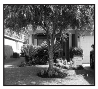
Section I 14118 Millglen

Please join us in congratulating our August 2011 Yard of the Month Winners!