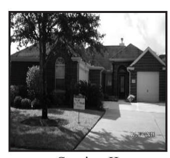
Section II 14103 Laurelstone