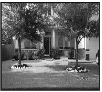
Section VII 14015 Blue Vista