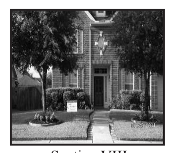
Section VIII 14023 Cobalt Glen