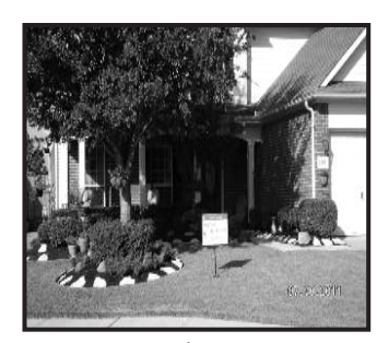
Section VI 2307 Cool Springs