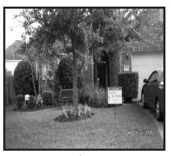
Section IV 14206 Valley Bend Ct.