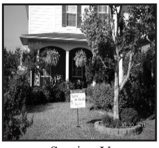
Section V 14231 Siver Glade