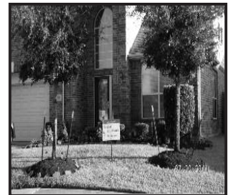
The Reserve 13738 Hartford Ct.