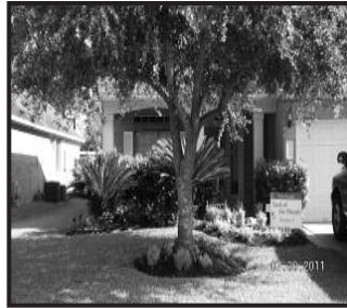
Section I 14118 Millglen

Please join us in congratulating our August 2011 Yard of the Month Winners!