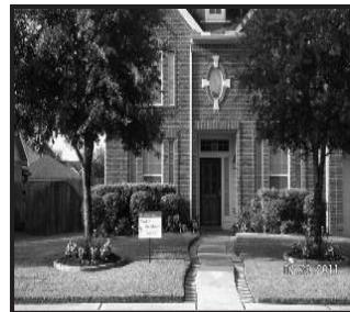
Section VIII 14023 Cobalt Glen