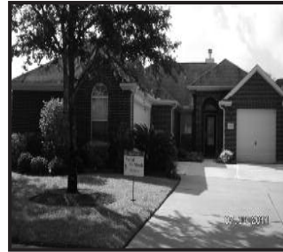
Section II 14103 Laurelstone