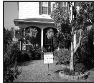
Section V 14231 Siver Glade