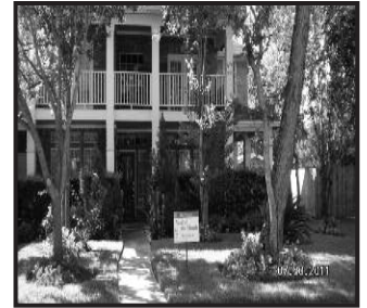
Section III 14003 Imperial Canyon