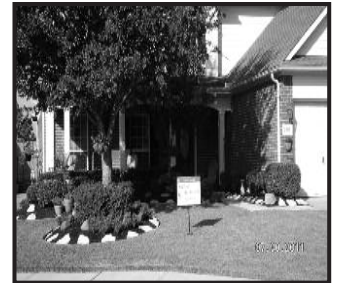
Section VI 2307 Cool Springs