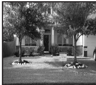
Section VII 14015 Blue Vista