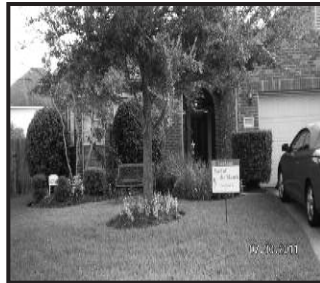
Section IV 14206 Valley Bend Ct.