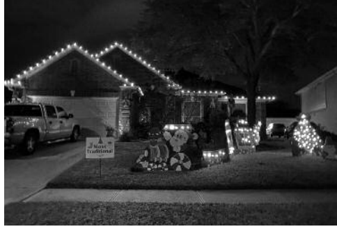
Most Traditional 14007 Abbey Rd.