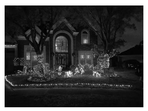
Most Holiday Spirit 14014 Sea Mytle