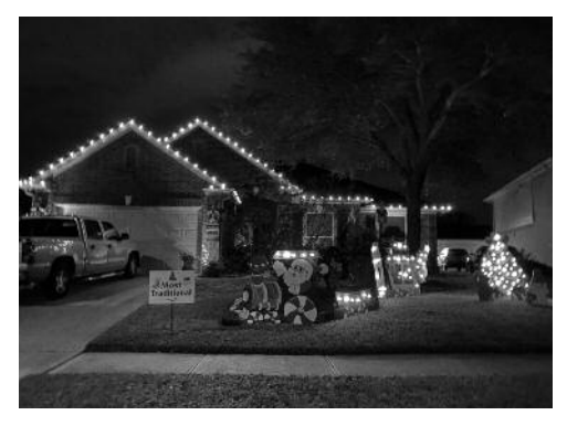
Best Children's Theme 14103 Laurelstone Ct.