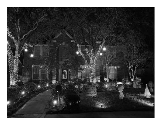
Best Winter Wonderland 14107 Braceridge Ct.