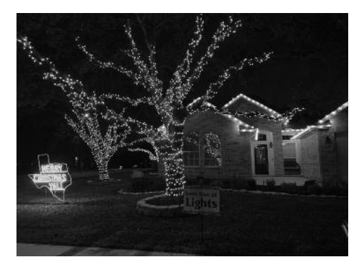
Best Use of Lights 14130 Millglen Ct.