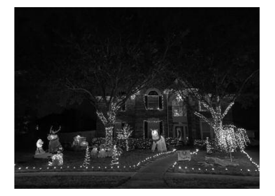
Most Creative 14003 Coral Bean