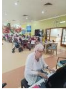
Left: Musical entertainment enjoyed by all.