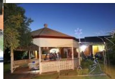
St John's recent Advent evening