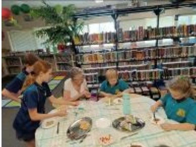
Left: Sharing activities with students from Kingaroy State School.