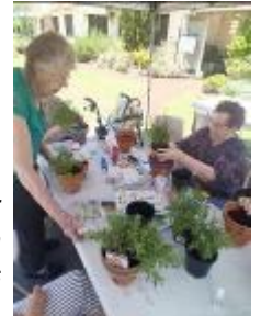
Right and Below: Stalls at the Orana Hilltop Markets