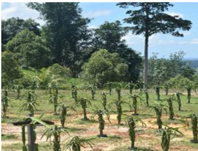
Basel Garden complex

We enjoyed our three weeks, meeting the clients and their families, as well as the many volunteers from the Handprints programs which cover a toy library, the 'I'm Able' baking program and a café. We were stunned by the beauty of the scenery around the Basel Garden, it resembled a more tropical version of our own South Burnett landscape.