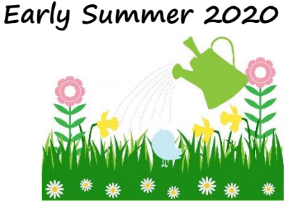
EDGE & TA Branch 256

"It was the best of times. It was the worst of times." *