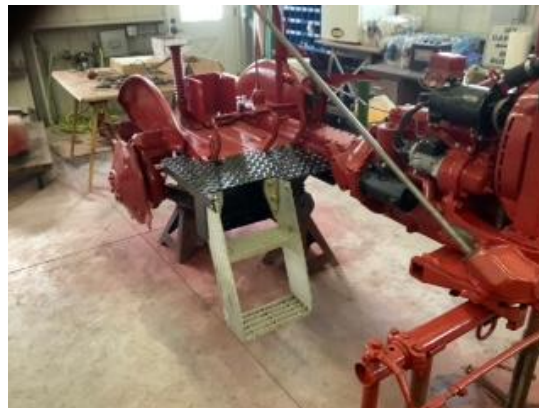
...the easy up steps

Show us what you are working on! Send an email to Bev Baker bgbake@comcast.net