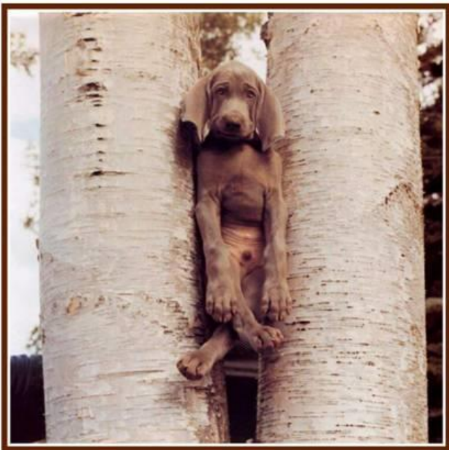
Some days all you can do is smile and wait for some kind soul to come pull your ass out of the bind you've gotten yourself into.

http://www.grandpasoldtractor.com/tractorhumor.html