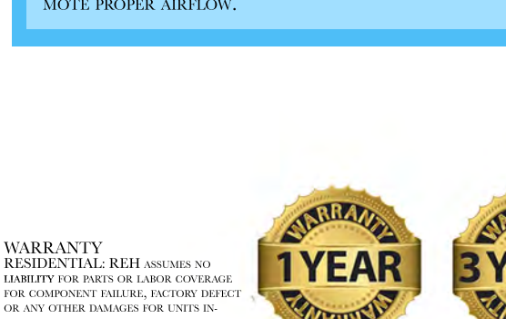
PARTS & LABOR