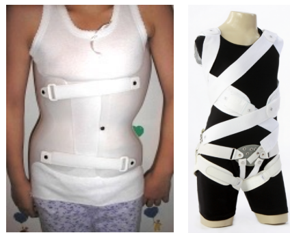
Hard brace / Cheneau vs.. Soft brace / SpineCor