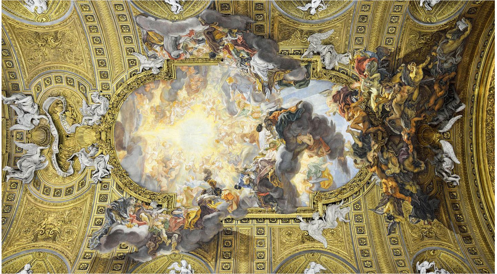
Giovanni Battista Gaulli, Church of Gesù, 1669-1683