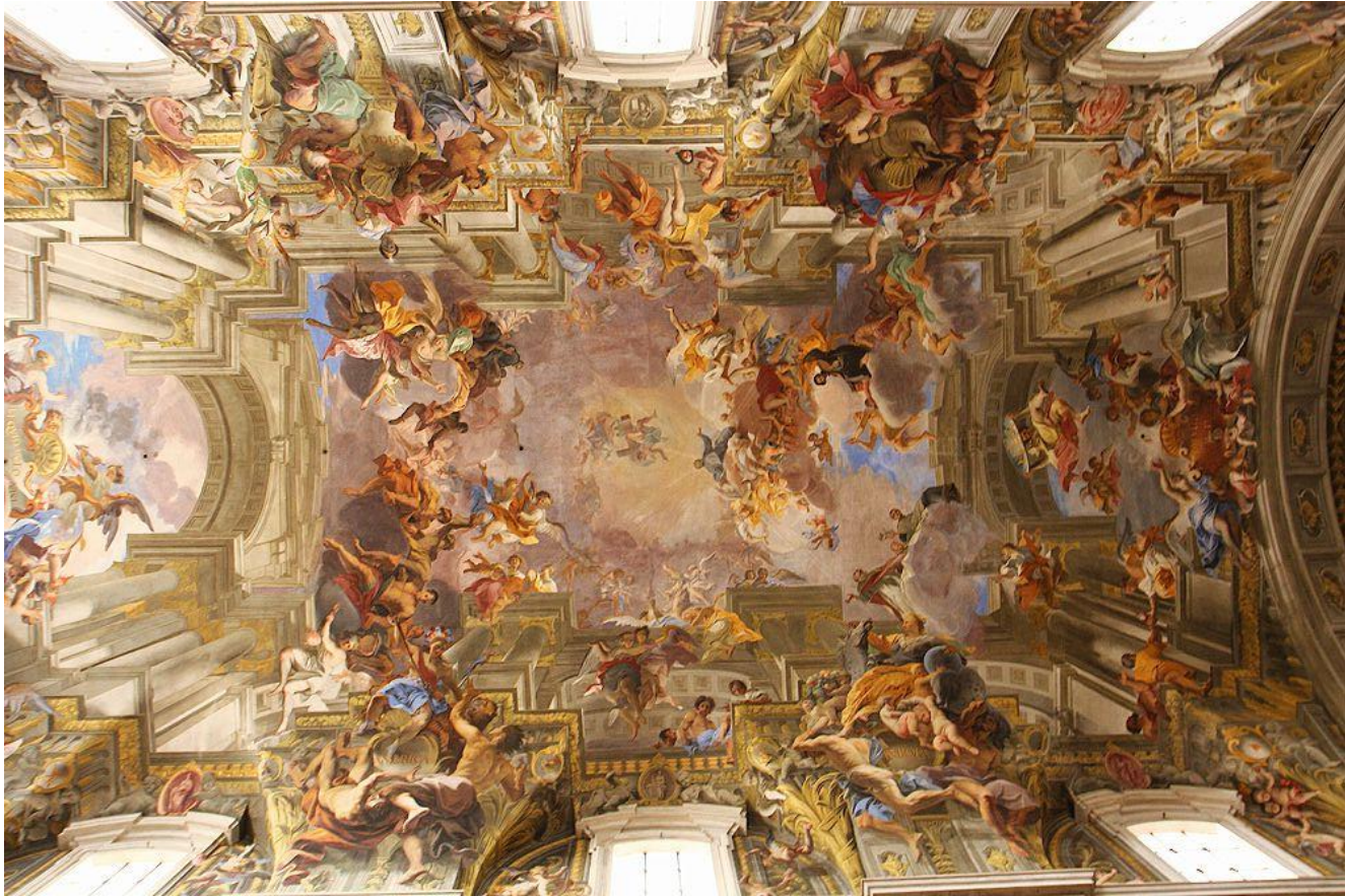
Church of St. Ignatius de Loyola, Andrea Pozzo, Rome, 1688-94 (Baroque)