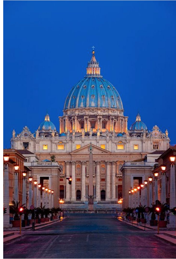
Papal Basilica of St. Peter in the Vatican