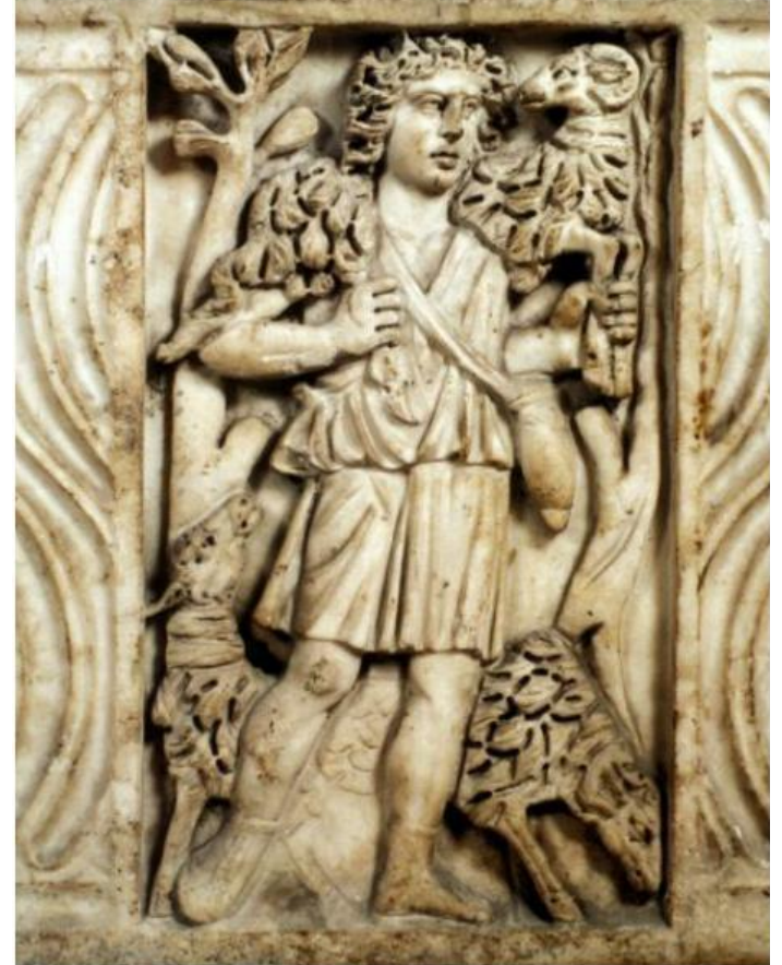
Early Christian (30 - 300 CE) depictions of Jesus as the Good Shepherd