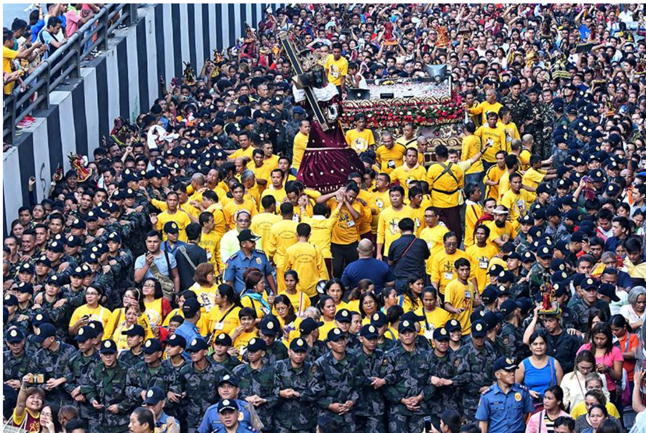
Black Nazarene of Quiapo Church, Philippines