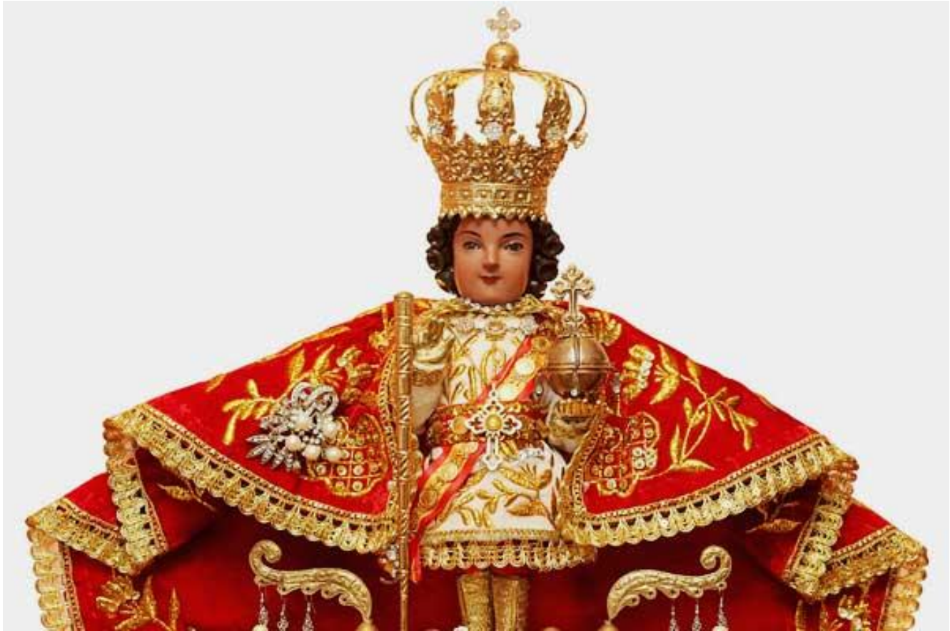
Sto. Niño de Cebu, Philippines