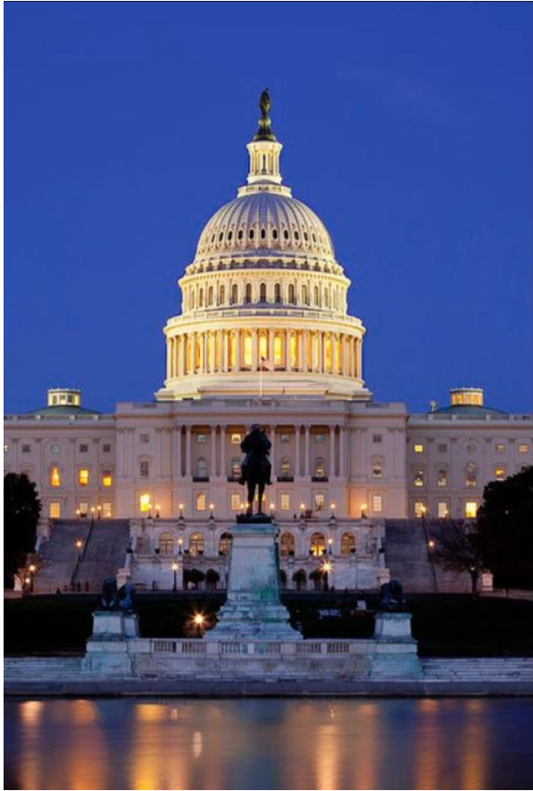
United States Capitol, Washington DC