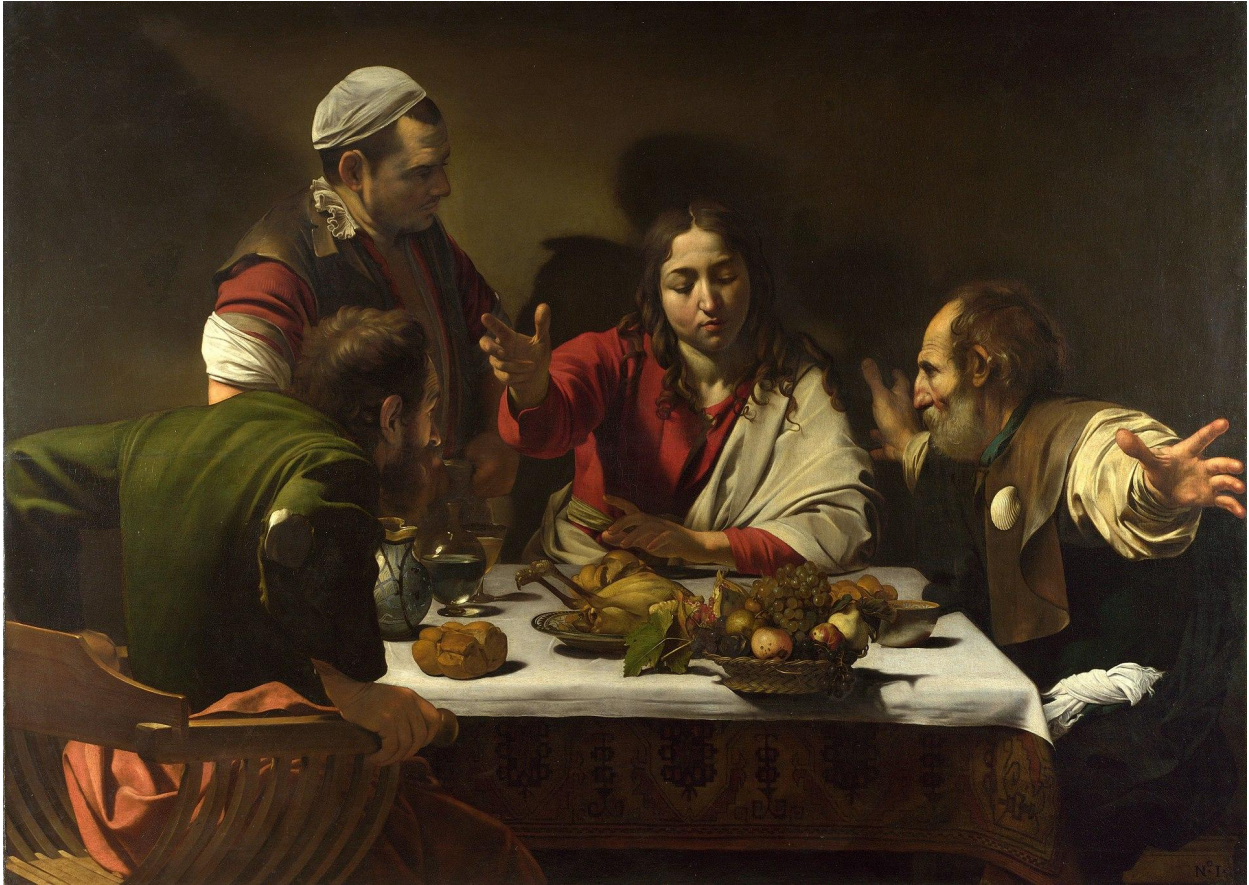
Caravaggio, Supper at Emmaus, 1602-3