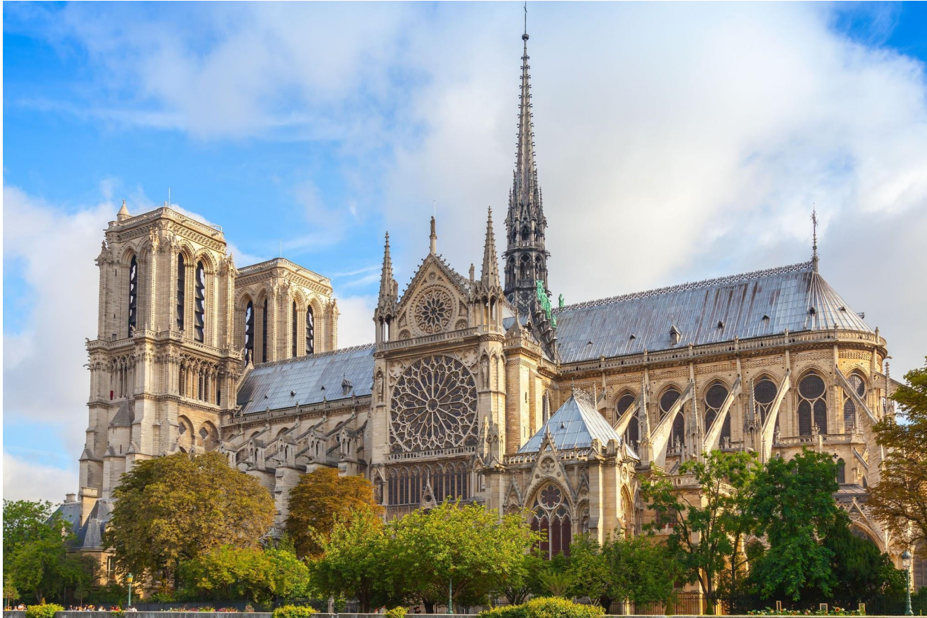
Notre Dame, Paris, France