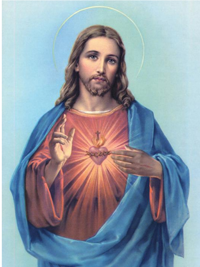
Depiction of Jesus from a Roman Catholic postcard