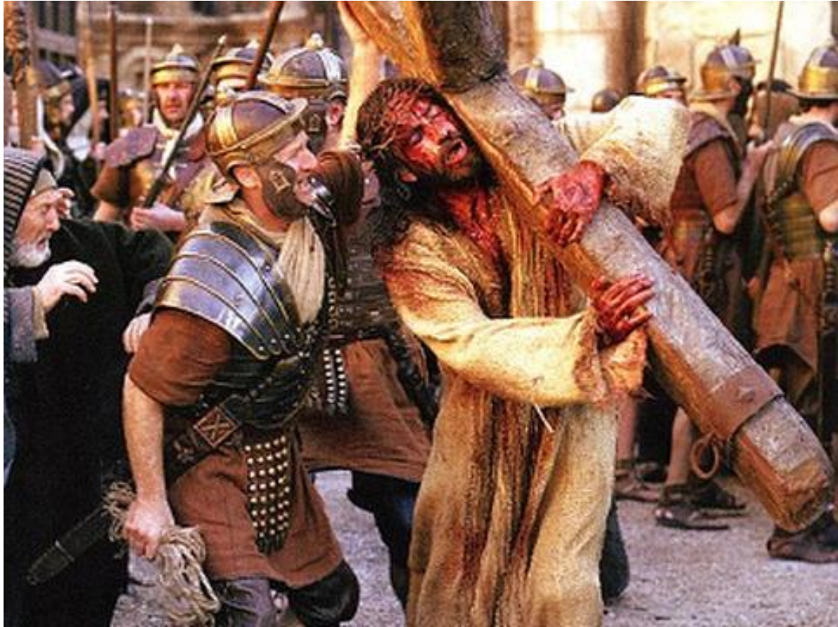
Jim Caviezel as Jesus in The Passion of the Christ