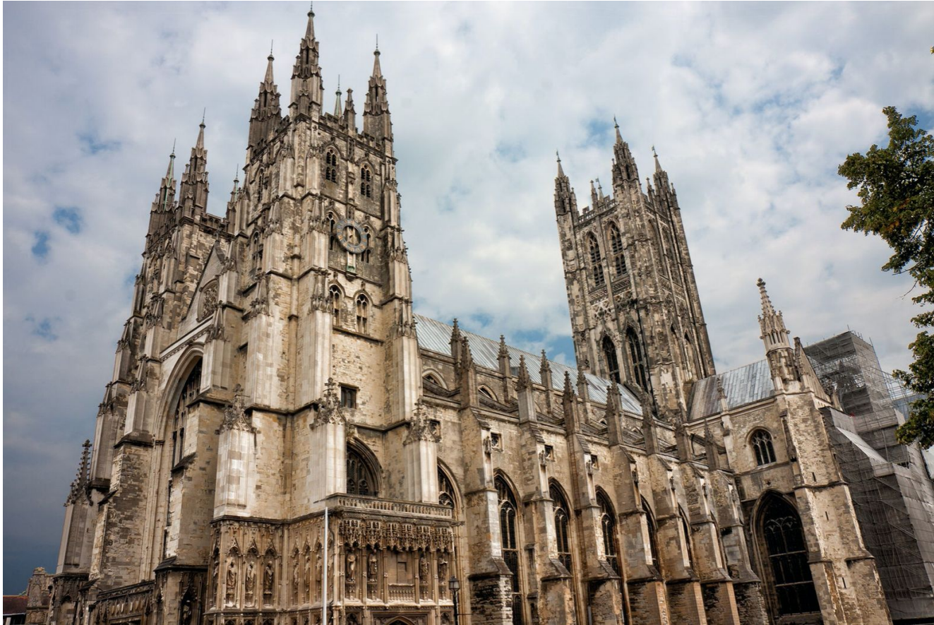
Canterbury Cathedral, England