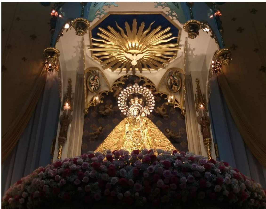
Our Lady of la Naval de Manila, Sto. Domingo Church, Quezon City, Philippines