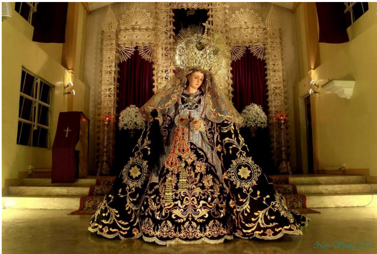
Virgen Dolorosa, Plumaria Sacred Vestments, Bocaue, Bulacan, Philippines