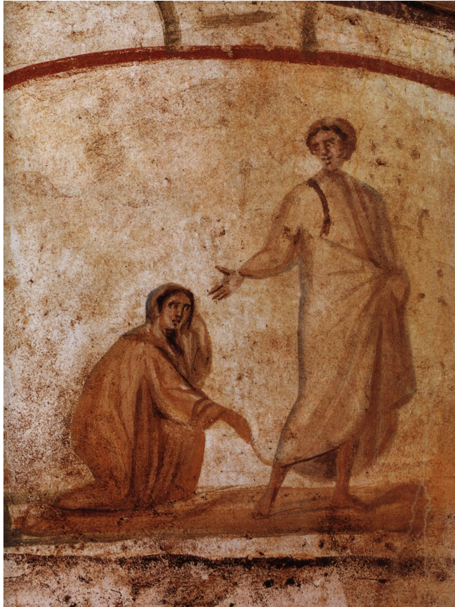
Jesus heals the bleeding woman, Roman catacombs, 300-350 CE