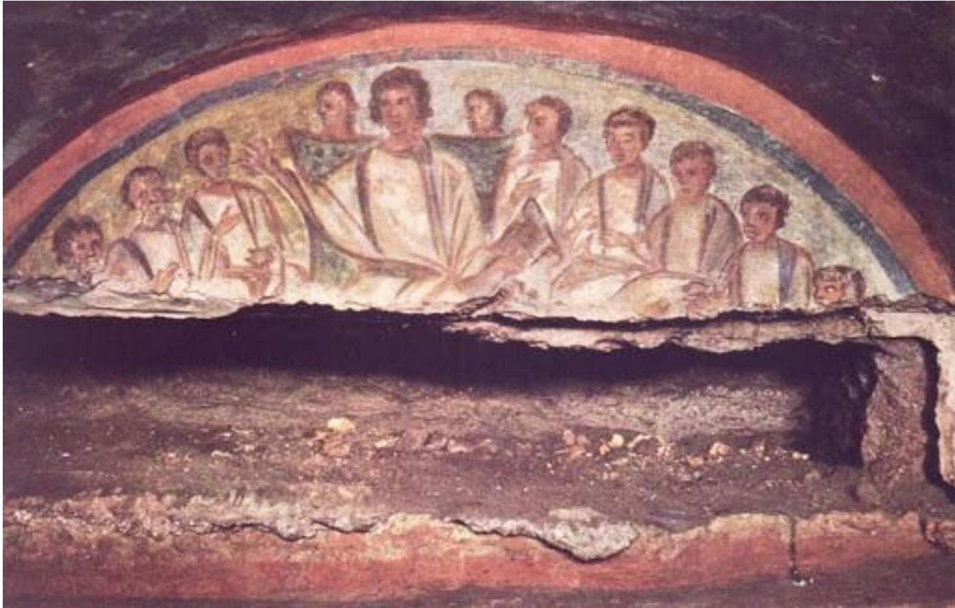
Jesus as depicted in the Catacombe di Domitillia, early 4th century