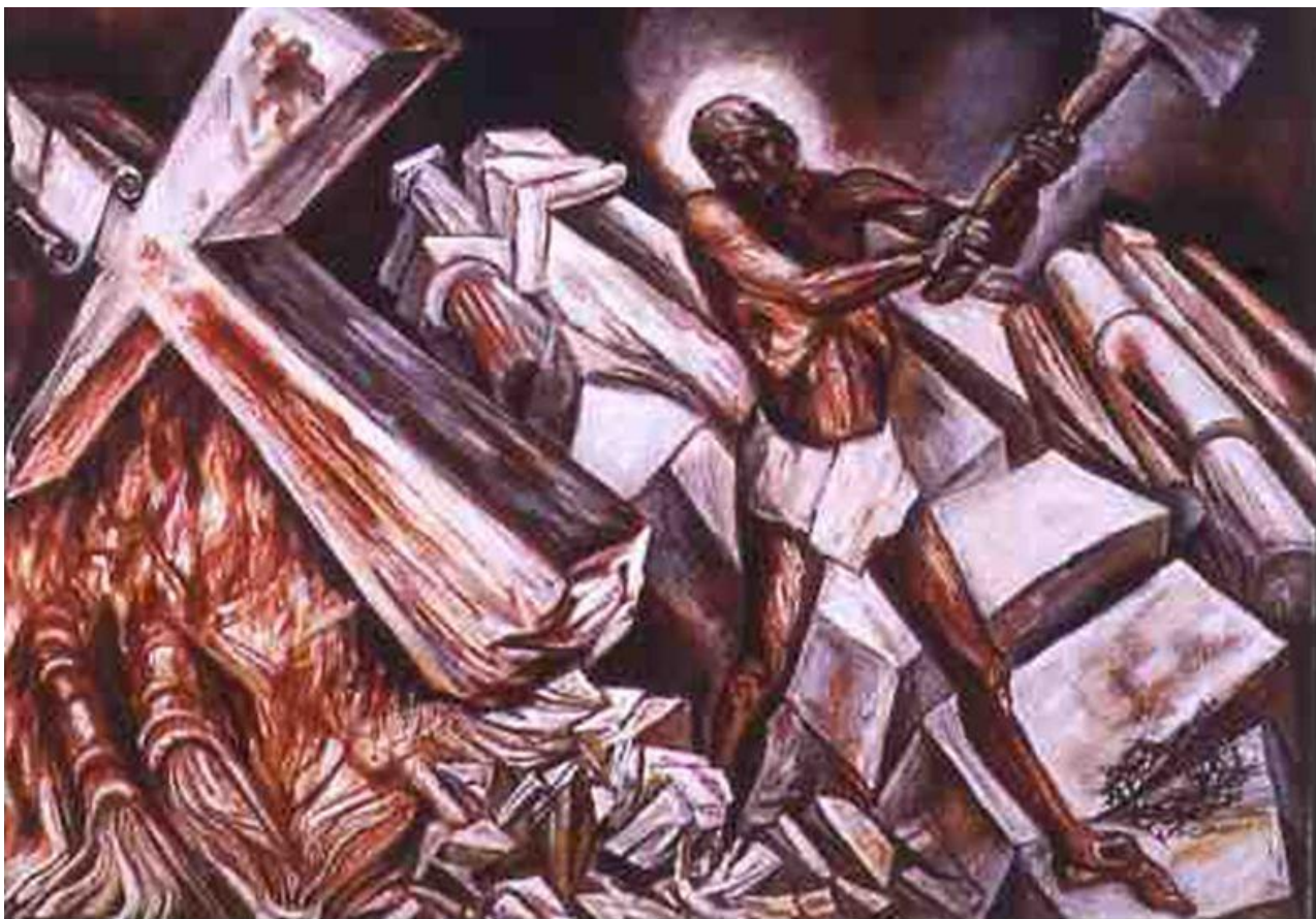
Jose Clemente Orozco, Christ Destroying his Cross, 1943