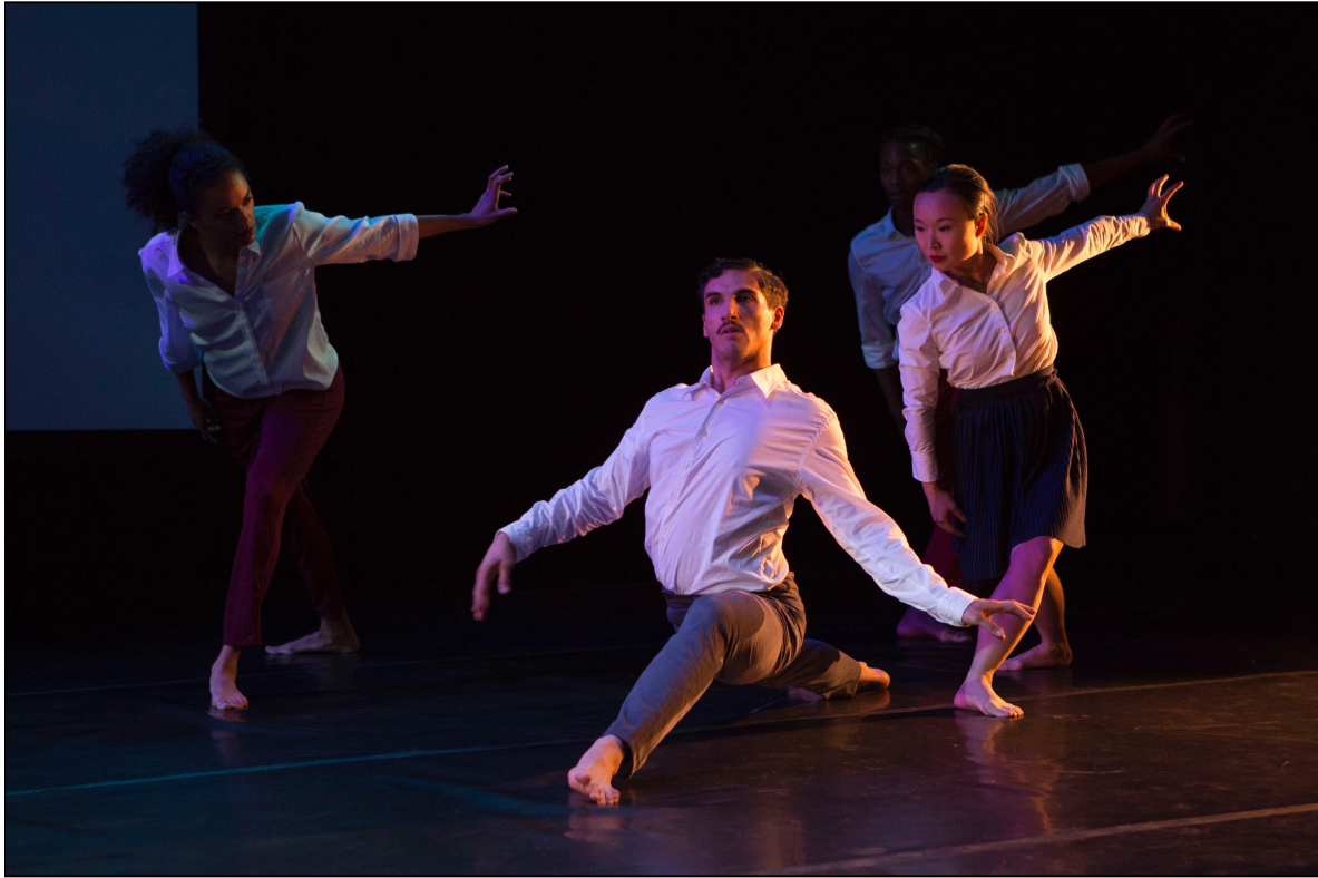
The DS&D company performing The Vortex at the Odyssey Theater, Los Angeles, 2018