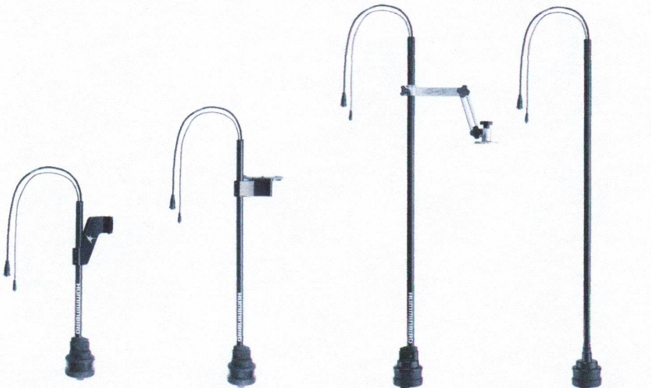
MEGA 360 IMAGING - FORTREX 411260-1