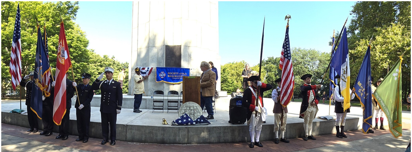
Combined SAR and FDNY Color Guard