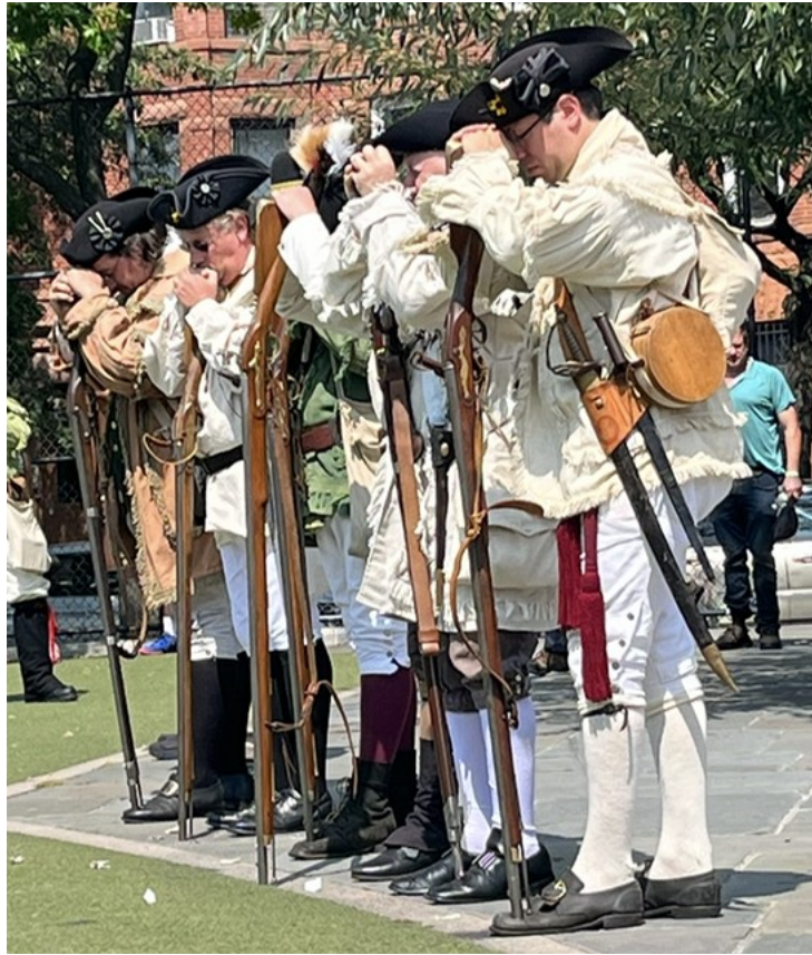
Musket Salute and Mourn Arms Tribute to the 1 st Maryland “the Immortals”