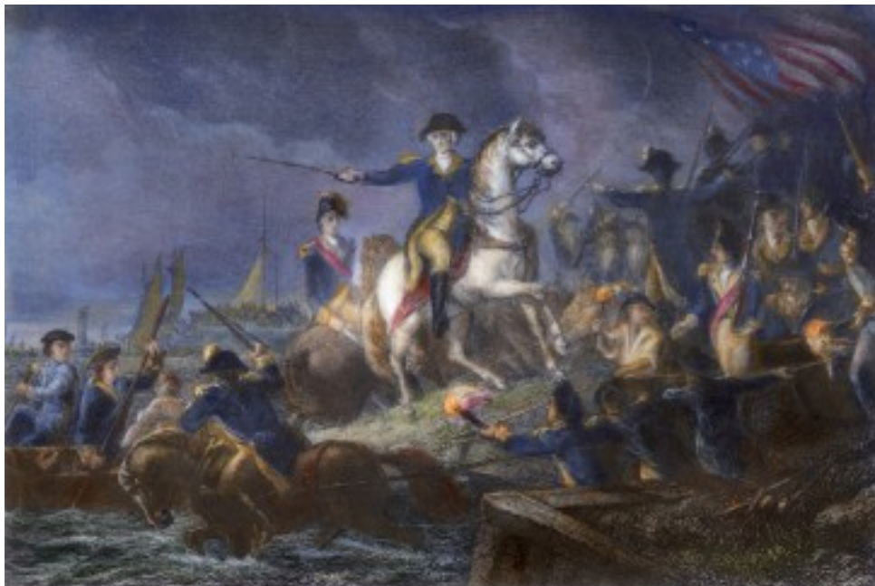
Evacuation of the Army at Brooklyn Ferry

In closing I am compiling the names of patriot ancestors of compatriots that fought at the Battle of Brooklyn to be read or published for the event, I will send out an e-mail blaster in the near future.