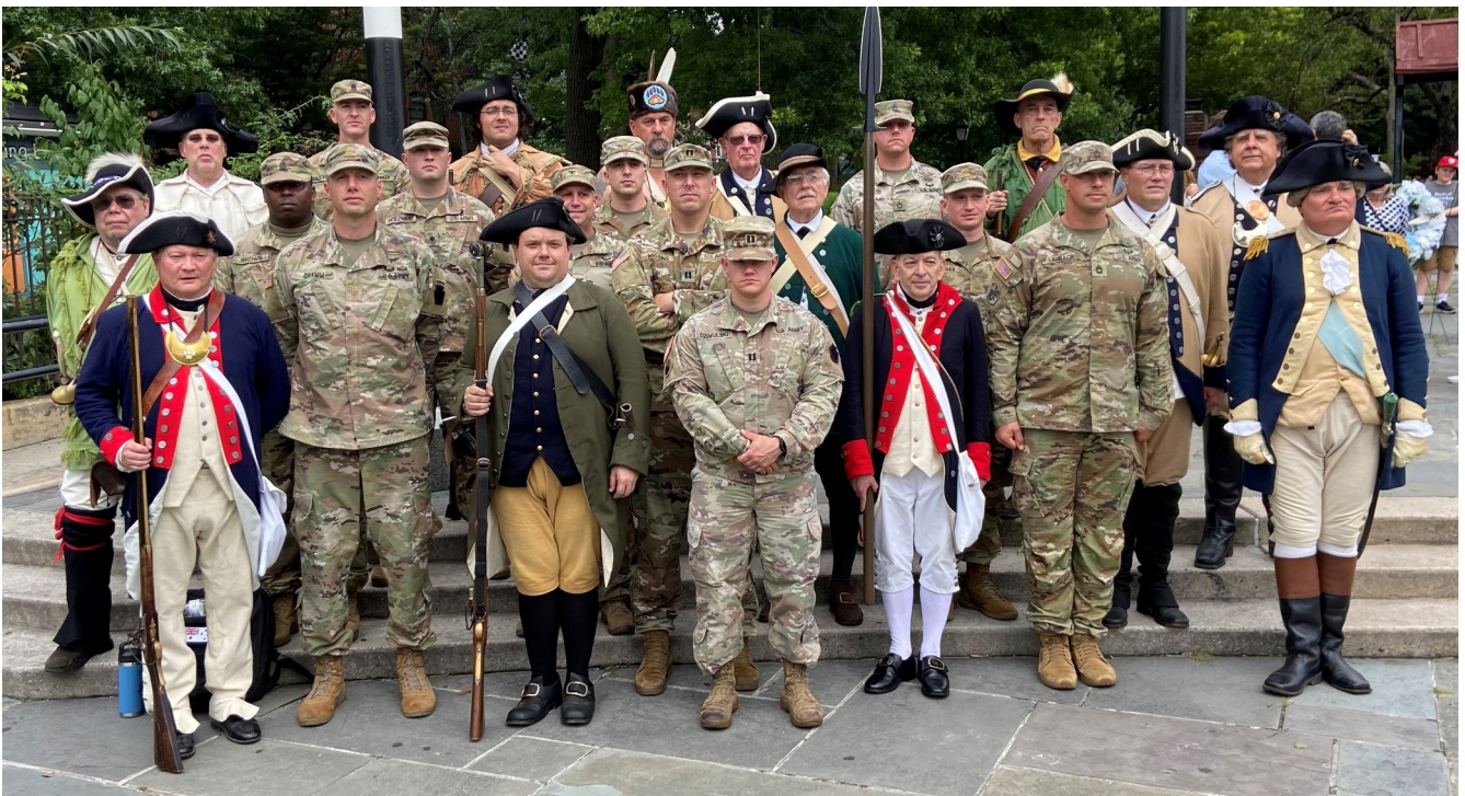
Last Year's SAR Color Guard, Musket Squad and Maryland National Guard