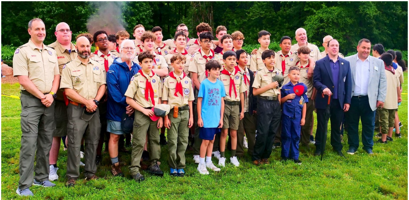
4 th of July Parade Battery Park, Lower Manhattan

A few pics of chapter members at the annual parade