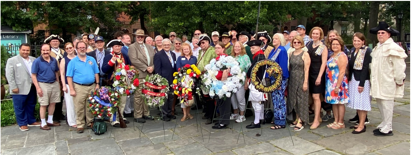
Last Year's Event DAR and SAR